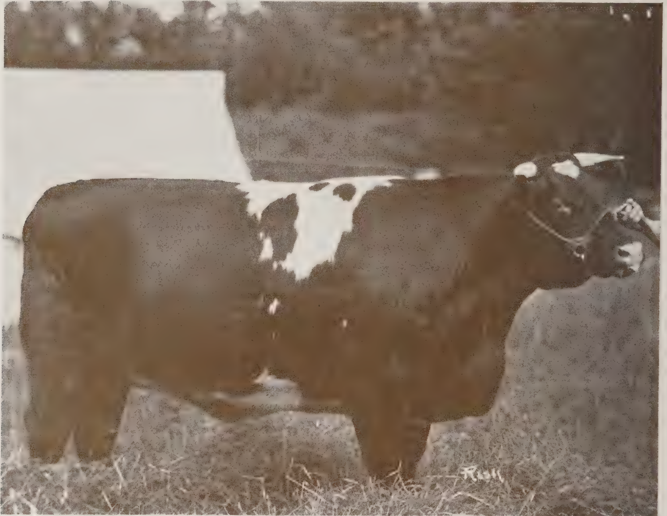
SUPREMACY —Grand Champion Cow wherever shown in 1922. Sired by Supreme Choice and out of a Merry Lady dam. Sold to Gov. Shallenberger in dam at our 1919 sale.